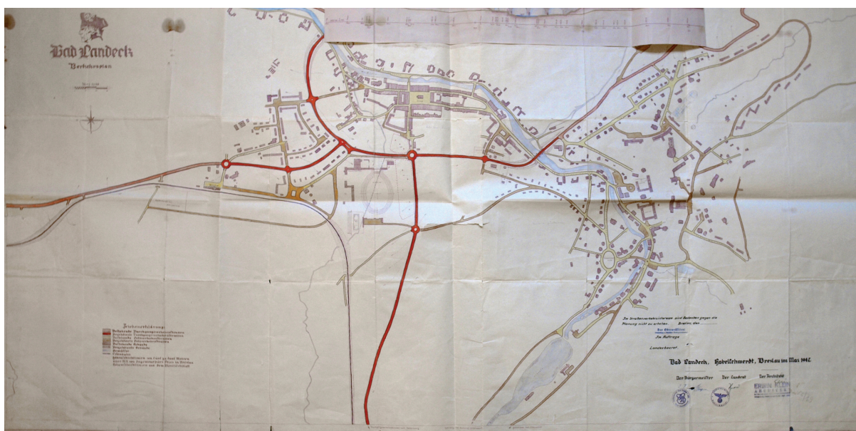
Fig. 9. Łądek-Zdrój, remodeling project of the town and resort – not completed, 1942 ( Verkehrsplan )

Il. 8. Łądek-Zdrój, niezrealizowany projekt przebudowy centrum uzdrowiska, 1941 ( Kurbezirk Bad-Landeck )