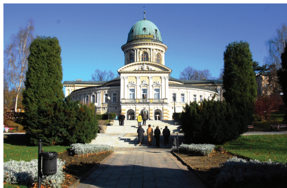
Fig. 6. Mary's Baths, view from John Paul II's Park

Apart from the systematic and consistent improvement of the conditions for providing therapies, the 19 th -century authorities of Łądek Zdrój tried to acquire and combine the lands around the baths where later green areas were designed. It seems, however, that no coherent development plan of the resort was prepared – consequently, the private houses as well as boarding houses located between the val-