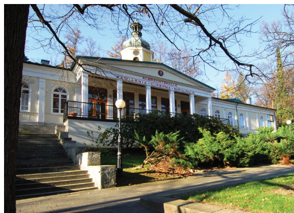
Fig. 4. Hall for walks ( Albrechtshalle , built after World War II), view from Central Park (photo: E. Trocka-Leszczynska, 2009)

Il. 4. Hala spacerowa ( Albrechtshalle , zabudowana po II wojnie światowej), widok od strony Parku Centralnego (fot. E. Trocka-Leszczynska, 2009)