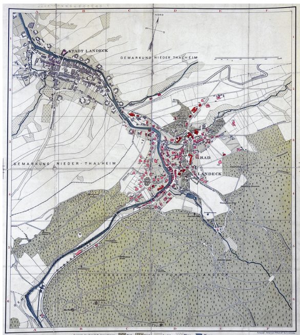
Fig. 5. Łądek Zdrój, plan of the town and health resort, 1890 ( Lage-plan von Bad Landeck anschließend Stadt Landeck in Schliesen )

Il. 5. Łądek-Zdrój, plan miasta i uzdrowiska, 1890 ( Lage-plan von Bad Landeck anschließend Stadt Landeck in Schliesen )