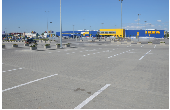
Fig. 4. Car parks situated at shopping centres occupy huge areas of the concrete surface

A new phenomenon for the majority of modern towns is a process of locating a great number of big shopping centres with the accompanying areas for car parks within the borders of cities (Fig. 3).