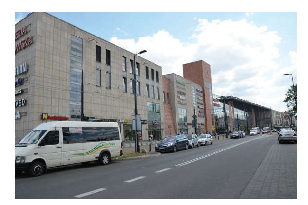
Fig. 3. Example of a great shopping centre complex – Galeria Krakowska (photo by H. Mełges, 2011)

II. 3. Przykład zespołu handlowego wielkopowierzchniowego – Galeria Krakowska (fot. H. Mełges, 2011)