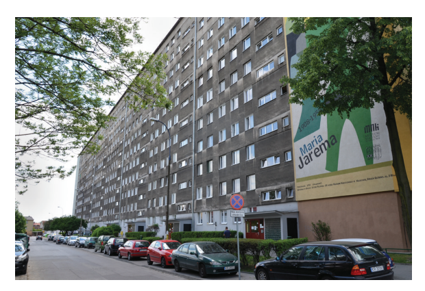
Fig. 2. Characteristic block development of Łobzów district