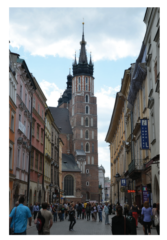
Fig. 1. Characteristic fragment of Cracow (magical place) – view from Floriańskia Street on Mariacki Church

On the example of Cracow, we can brilliantly follow the origins of the city since the 10<sup>th</sup> century with its magnificent Roman examples of town architecture. Excellent examples of the Gothic, Renaissance, Baroque, Classicism or the 19<sup>th</sup>-century structures of the then new urban compositional ideas, in spite of their style differences, retained this basic feature of unifying and merging due to their scale and proportions. A logical medley of styles and urban coherence constitute a unique magnificent example of a specific 'symbiosis' of selecting modules, proportions, sizes of buildings along with their details, etc. This uniformity is confirmed by a special ability to find solutions for squares and streets with particular almost theatrical scenery and with exposing perspective closures which are accented by, for example, height dominants (Fig. 1).