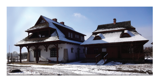
Fig. 4. Biłgoraj, "Borderland Town", market square, western frontage

II. 4. Biłgoraj, "Kresowe miasteczko", rynek, pierzeja zachodnia