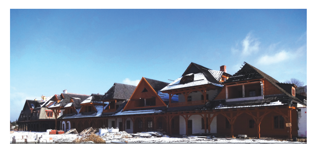
Fig. 3. Biłgoraj, "Borderland Town", market square, eastern frontage (photo by A. Tejszerska, 2018) Il. 3. Biłgoraj, "Kresowe miasteczko", rynek, pierzeja wschodnia