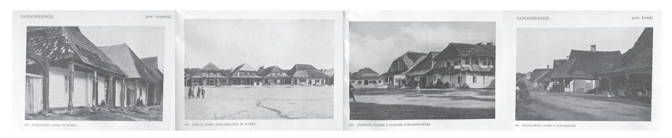
Fig. 2. Arcaded buildings of the Lublin region market squares (source: [18]) II. 2. Podcieniowa zabudowa rynków Lubelszczyzny (źródło: [18])

with a very strong and until recently practised tradition of wooden building trades, a model called the "Borderland Town" ("Kresowe miasteczko")<sup>4</sup> is being established. The foundation "Biłgoraj XXI", at the initiative and largely funded by a private person<sup>5</sup> is building an architectural complex, which in terms of external form, uses traditional materials and construction methods. To some extent it resembles an open-air museum. It is not a strictly museum-like concept, similar to the contemporary reconstructions of fragments of small towns found in open-air museums in Lublin or Sanok. The investors intend the Biłgoraj "town" to be a "hybrid" of an open-air museum and a residential-service district – a museum "living its own new life".