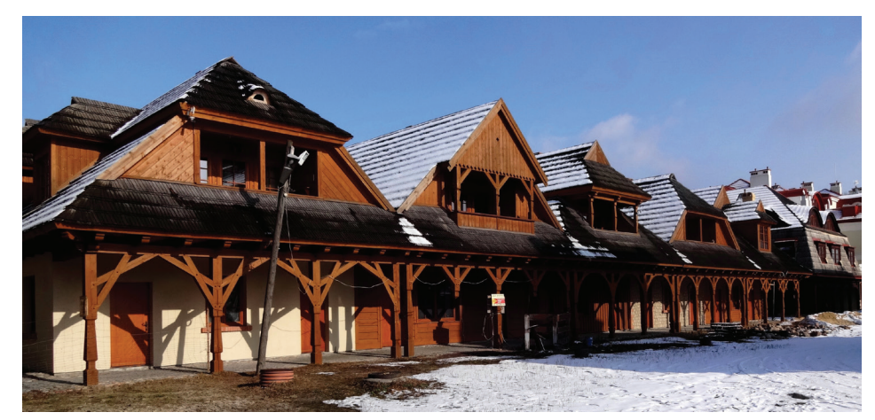
Fig. 1. Biłgoraj, "Borderland Town", market square, northern frontage Il. 1. Biłgoraj, "Kresowe miasteczko", rynek, pierzeja północna