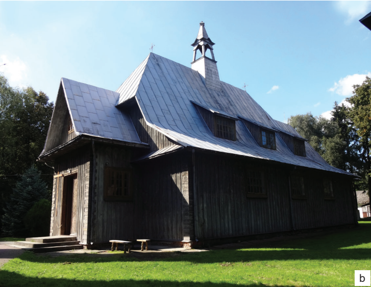
Fig. 10. Tworyczów, church of St. Apostles Peter and Paul (1932–1933): a) façade, b) east elevation II. 10. Tworyczów, kościół pw. św. Apostołów Piotra i Pawła (1932–1933): a) fasada, b) elewacja wschodnia

terms of the material fabric and the introduced function, exacerbating the problem of the falsification of historical reality. It should be realized that cultural tourism, which provides direct experience of communing with a specific reality, is a form of education of the highest value in terms of assimilation. A memorable image of the concept definitely has a stronger impact on the recipient than theoretical information presented in book publications.