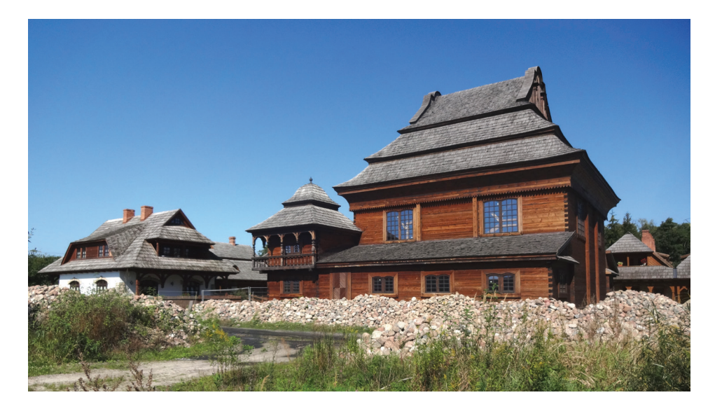
Fig. 7. Biłgoraj, "Borderland Town", replica of the synagogue from Wołpa, southern façade Il. 7. Biłgoraj, "Kresowe miasteczko", replika synagogi z Wołpy,

elewacja południowa