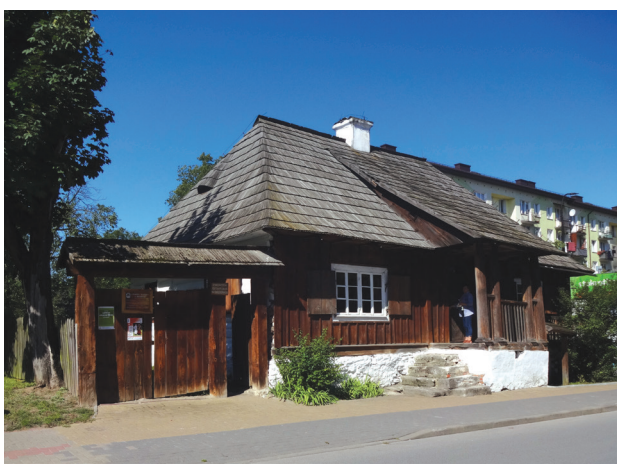
Fig. 6. Biłgoraj, open-air museum "Sievemakers Farm", front elevation

II. 5. Poundbury, pasaż Cambridge – rynek