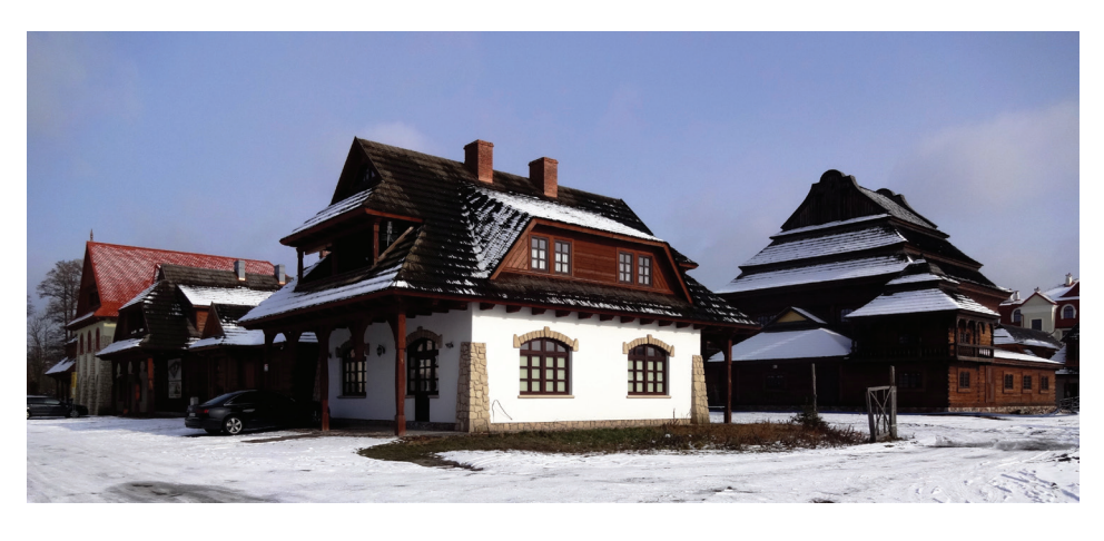
Fig. 8. Biłgoraj, "Borderland Town", view of the market square from the southwest corner II. 8. Biłgoraj, "Kresowe miasteczko", widok rynku z południowo-zachodniego narożnika

elewacja południowa