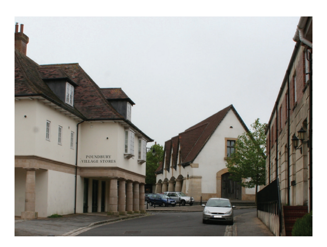
Fig. 5. Poundbury, Cambridge Walk – city centre – market square

II. 5. Poundbury, pasaż Cambridge – rynek