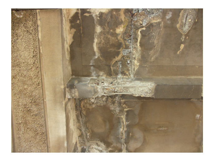
Fig. 8. Former St. Jobsveem warehouse. The underside of the concrete platforms before restoration. The plaster finish of the tapered bracket (bottom) combines a spatter dashed field with a combed trim. The surface textures of the ceilings show severe damage and colour variation. The reinforcement steel of the secondary beam appeared severely corroded

II. 8. Dawny magazyn St. Jobsveem. Spód podestów betonowych przed renowacją. Dwie faktury tynku wspornika (dolnego) – nakrapiany i czesany. Powierzchnie sufitu wykazują poważne uszkodzenia i różnice kolorystyczne. Stal zbrojeniowa belki wydawała się poważnie skorodowana