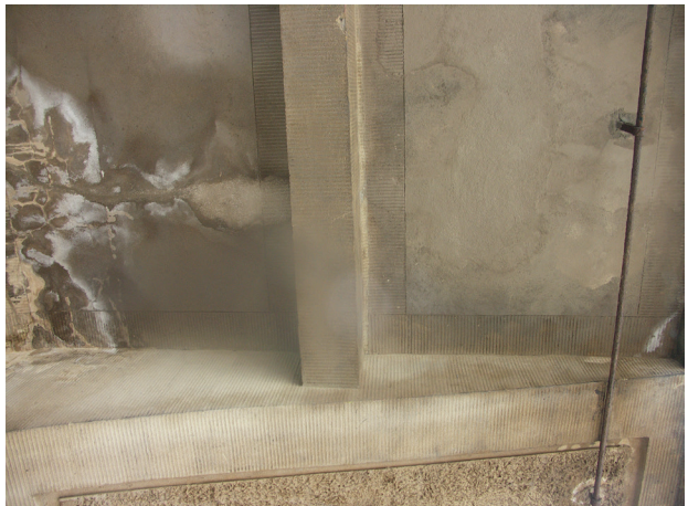
Fig. 9. Former St. Jobsveem warehouse. A similar area after concrete repair and partial restoration of the dressed plaster finishes, including the combed finish of the secondary beams and around the smoothly finished ceiling. The colour is touched up with a stain

II. 8. Dawny magazyn St. Jobsveem. Spód podestów betonowych przed renowacją. Dwie faktury tynku wspornika (dolnego) – nakrapiany i czesany. Powierzchnie sufitu wykazują poważne uszkodzenia i różnice kolorystyczne. Stal zbrojeniowa belki wydawała się poważnie skorodowana