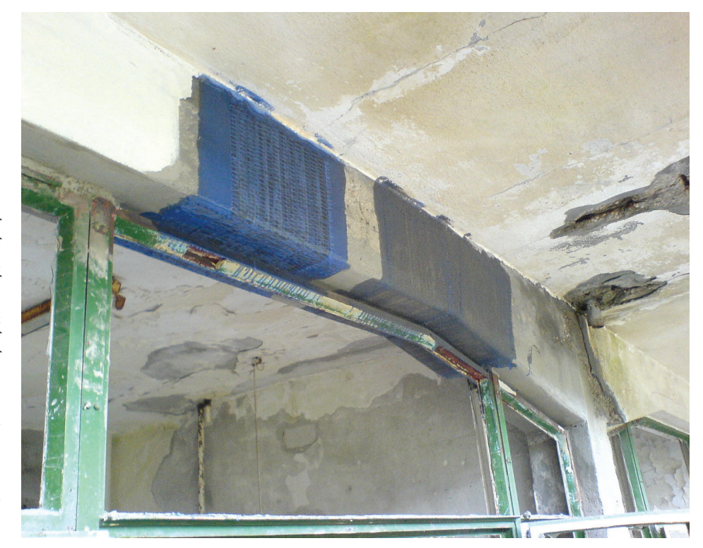
Fig. 10. Sample tests of strengthening the bearings of the longitudinal beams with carbon fabric, after removal of the render and plaster finishes. The method proved effective but could not resolve the lack of load-bearing capacity of the columns themselves

As we are increasingly dealing with the youngest generation of modern heritage we are running into these issues more and more. In these buildings we often see an extensive use of architectural exposed concrete, featuring