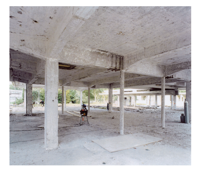
Fig. 2. "Zonnestraal" sanatorium, main building (1928), ground floor during the restoration works. The render and plaster finishes have been blasted off revealing the slenderness of the actual reinforced concrete structure. The metal brackets involve a repair that dates to the time of construction (photo: © WDJArchitecten, around 2002)

II. 2. Sanatorium "Zonnestraal", budynek główny (1928), parter w trakcie prac konserwatorskich. Usunięcie tynków uwidoczniło smukłość oryginalnej konstrukcji żelbetowej. Metałowe wzmocnienia ukazują naprawę z czasów budowy (fot. © WDJArchitecten, około 2002)