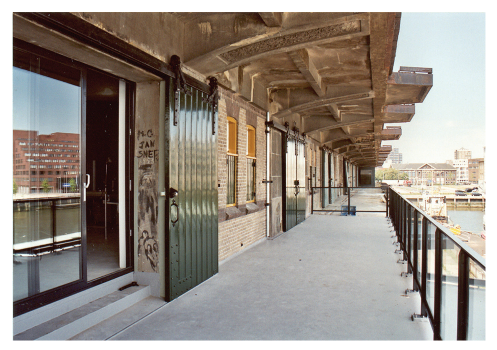
Fig. 7. Former St. Jobsveem warehouse. The installment of a model apartment included trial repairs of the concrete decks that were to serve as terraces. The underside of the platform above still shows the damage to the plaster finish that was originally dressed to mimic natural stone

II. 6. Magazyn St. Jobsveem (1914) w dokach Rotterdamu po przekształceniu w kondominium ze 109 mieszkaniami w 2007. Dzięki dużej nośności ogromnych żelbetowych platform ładunkowych można je było przekształcić w wiszące ogrody