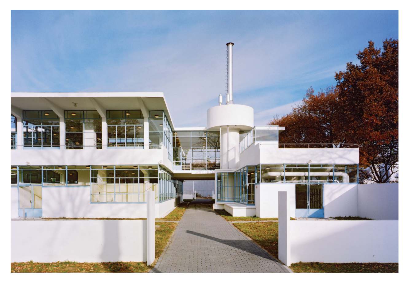
Fig. 1. "Zonnestraal" sanatorium, main building (1928) after restoration in 2003. View through one of the driveways that were restored

II. 1. Sanatorium "Zonnestraal", budynek główny (1928) po renowacji w 2003 r. Widok przez jeden z odrestaurowanych podjazdów