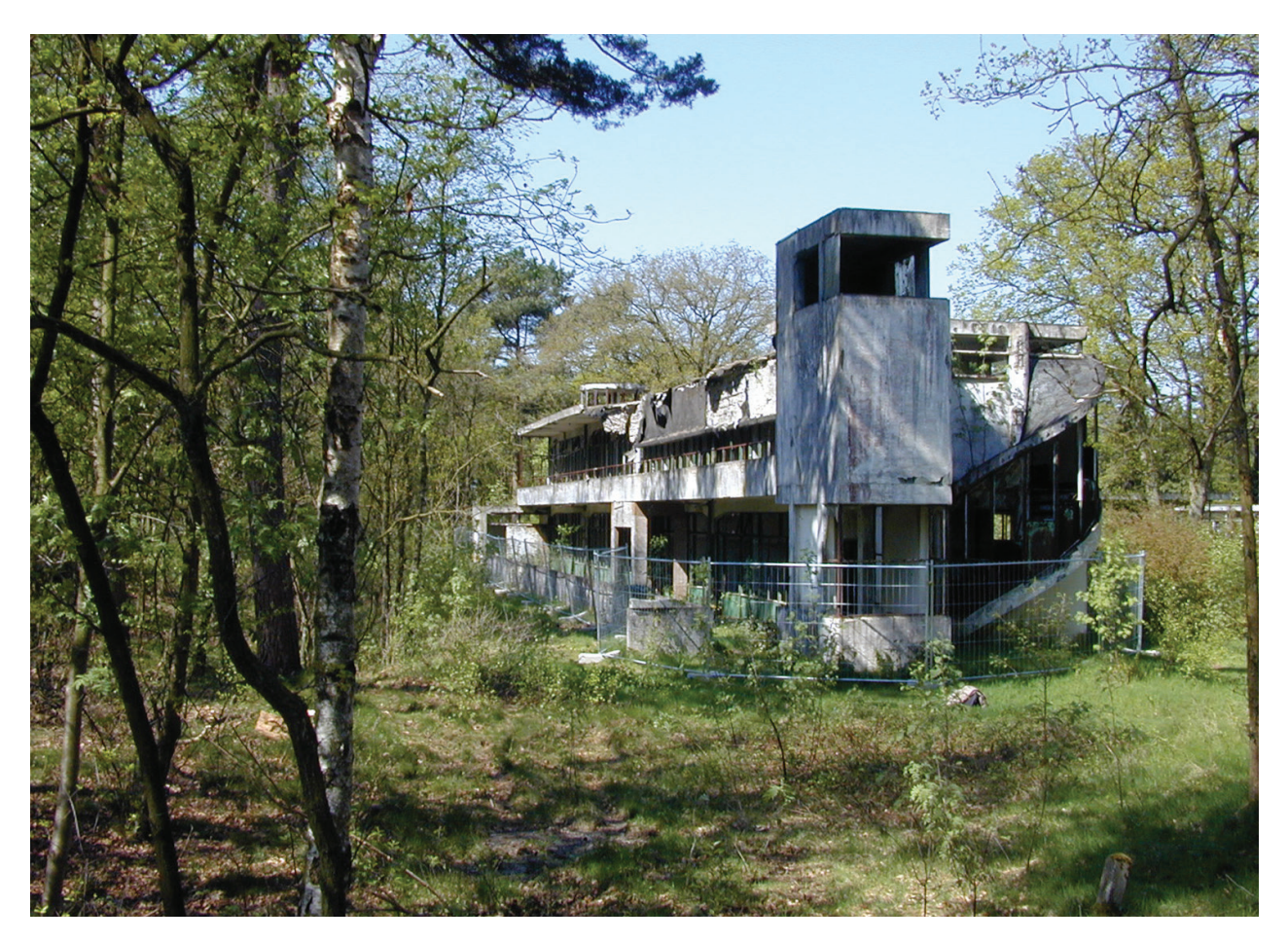
Fig. 11. "Zonnestraal", Dresselhuys Pavilion (1931) after the collapse of the chloride-infused reinforced concrete roof slab. The exterior restoration of this structure was completed in 2013

II. 11. "Zonnestraal", Pawilon Dresselhuys (1931) po zawaleniu się żelbetowej płyty dachowej poddanej procesowi korozji chlorkowej. Renowację budynku od zewnątrz zakończono w 2013 r.