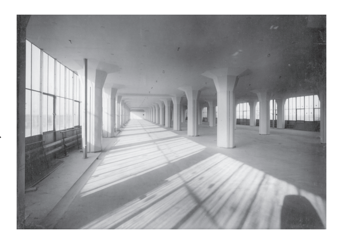
Fig. 4. The Van Nelle Factory interior shortly before completion in 1928. The octagonal mushroom-head columns allowed for the use of floorslabs without beams. The flush ceilings benefit daylight conditions. The columns feature metal rails on four sides for the fixing of production equipment

Wspornikowe wysunięcie stropów zmniejsza momenty statyczne, co pozwala na bardziej ekonomiczne projektowanie płyt żelbetowych. Ponadto ściana osłonowa mogła przebiegać nieprzerwanie na całej wysokości budynku