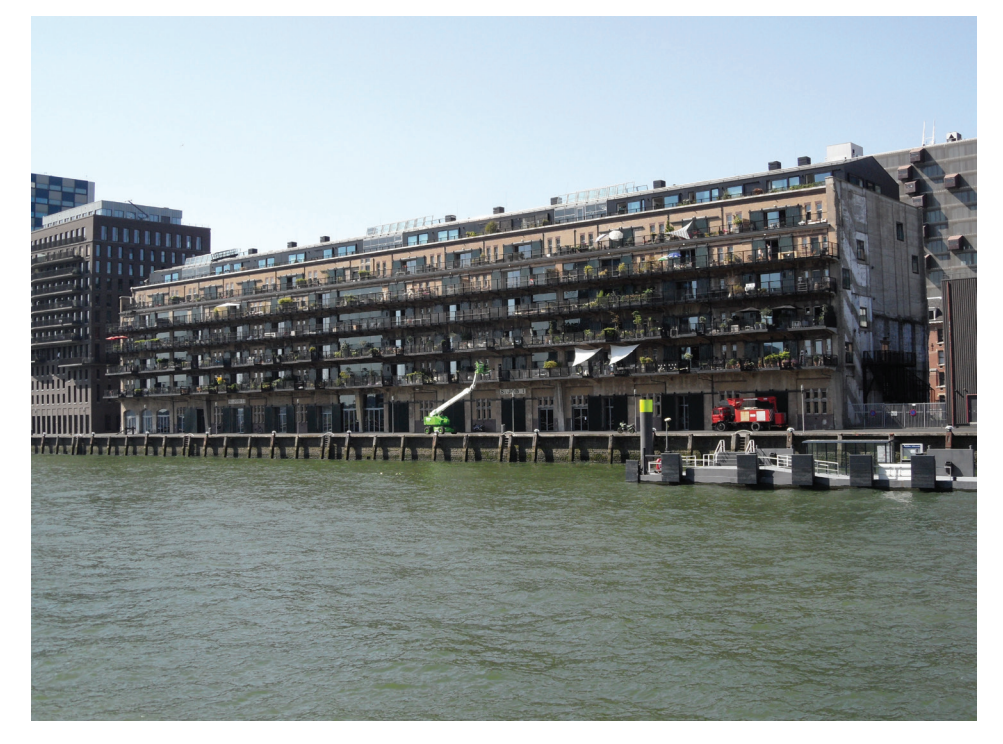
Fig. 6. The St. Jobsveem warehouse (1914) in the Rotterdam docklands after conversion into a condominium with 109 apartments in 2007. Due to the ample loadbearing capacity of the huge reinforced concrete loading platforms these could be transformed into hanging gardens.

II. 6. Magazyn St. Jobsveem (1914) w dokach Rotterdamu po przekształceniu w kondominium ze 109 mieszkaniami w 2007. Dzięki dużej nośności ogromnych żelbetowych platform ładunkowych można je było przekształcić w wiszące ogrody