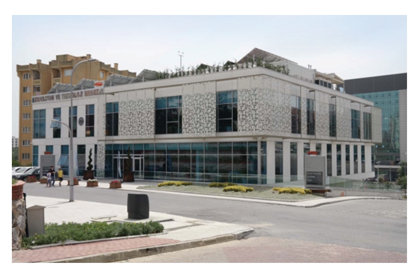
Fig. 1. Başakşehir Living Lab Building II. 1. Budynek Başakşehir Living Lab

In 2018 and 2019, BLL organized several workshops to raise awareness of the efficient use of resources and sustainability throughout the community. The workshop in the scope of this paper is a part of this workshop series, with an emphasis on environmental problems like waste management. As the effects of environmental problems