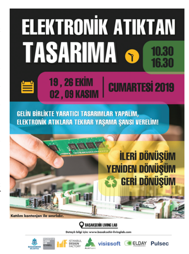
Fig. 3. The poster for the workshop announcement

The workshop series, as well as the questionnaire was attended by a total of 48 people. According to the answers of the first section, 22 of the attendees were male, and 26 were female. 39 attendees were at undergraduate level, as 9 were high school graduates. Regarding the age of the