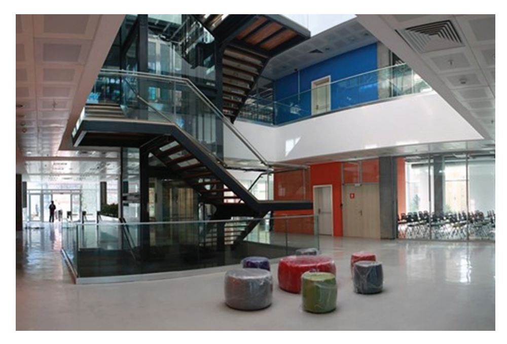
Fig. 2. Interior of Başakşehir Living Lab Building II. 2. Wnetrze Başakşehir Livi

Il. 2. Wnętrze Başakşehir Living Lab Building