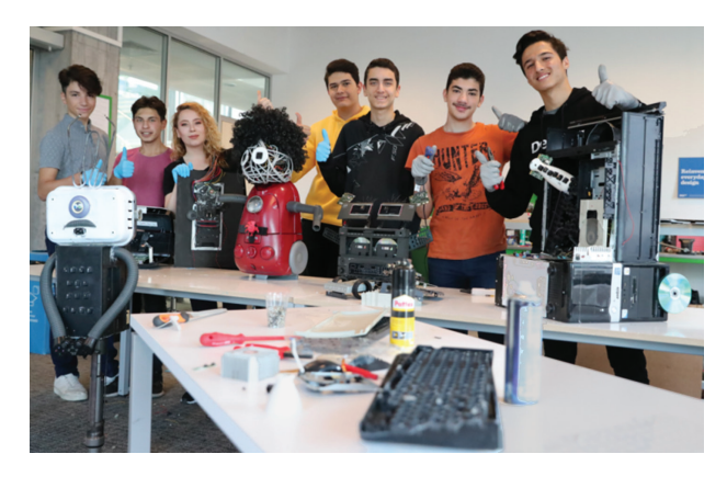
Fig. 4. Some workshop participants and their products

Il. 3. Plakat informujący o warsztatach