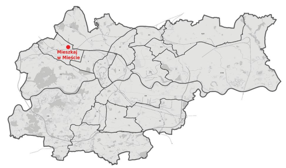
Fig. 1. Wizjonerów Estate in Krakow. Location of the investment on the map of Krakow (elaborated by R. Oleksik based on www.msip.krakow.pl) Il. 1. Osiedle Wizjonerów w Krakowie. Lokalizacja inwestycji na mapie miasta (oprac. R. Oleksik na podstawie www.msip.krakow.pl)

PM10 particulate matter in 2018 for the measurement station located closest to the housing estate, i.e., at Złoty Róg Street in Krakow, was 43 µg/m<sup>3</sup>, with the maximum value being 69 \mu g/m<sup>3</sup> [7]. As compared to year 2020 for the same location, the mean and maximum results were much lower, namely 30 and 52 µg/m<sup>3</sup> respectively [8]. As can be seen, the situation has improved. Several factors may have contributed to this. Among the most important ones is the fact that since September 1, 2019 there is a total ban on solid fuels, i.e., coal and wood, in Krakow. In addition, the city is trying to put emphasis on reducing car traffic and promoting cycling as an important means of transport. Also, the popularisation of renewable energy and stricter provisions concerning the requirements for thermal insulation in the Rozporządzenie Ministra Infrastruktury z dnia 12 kwietnia 2002 r. w sprawie warunków technicznych... [Regulation of the Minister of Infrastructure of 12 April 2002 on technical specifications for building and their location] [5] fills with optimism as regards the influence of