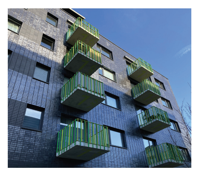
Fig. 7. Wizjonerów Estate in Krakow. Wizjonerów stage with visible clinker façade

In the Mieszkaj w Mieście – Wizjonerów Estate, a variety of façade materials were used, such as clinker façade in the Wizjonerów stage (Fig. 7). This material is natural. It is resistant to weather conditions and has high mechanical strength, thanks to which it does not require frequent preservation. It is resistant to fire, chemical and biological corrosion, and to the factors that may cause allergies. In the subsequent stages, the façades were made using the ventilated façade system (Fig. 8). The structural walls are made of reinforced concrete, and on the higher storeys they are partly brick-built. The ceilings of all buildings are also made of reinforced concrete. Due to the use of reinforced concrete in future, it is worth analysing the influence of reinforcement used in the building on the level of electric field generated by wireless communication systems [18]. To sum up, according to the Polish construction law [19], every new investment commissioned (including the housing estate discussed here) should meet the basic