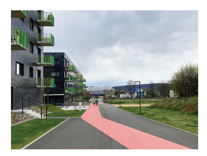
Fig. 3. Wizjonerów Estate in Krakow. Wizjonerów stage with view on the northern slope of the Wolski Forest (photo by R. Oleksik)

II. 3. Osiedle Wizjonerów w Krakowie. Etap Wizjonerów z widokiem na północne zbocze Lasu Wolskiego (fot. R. Oleksik)