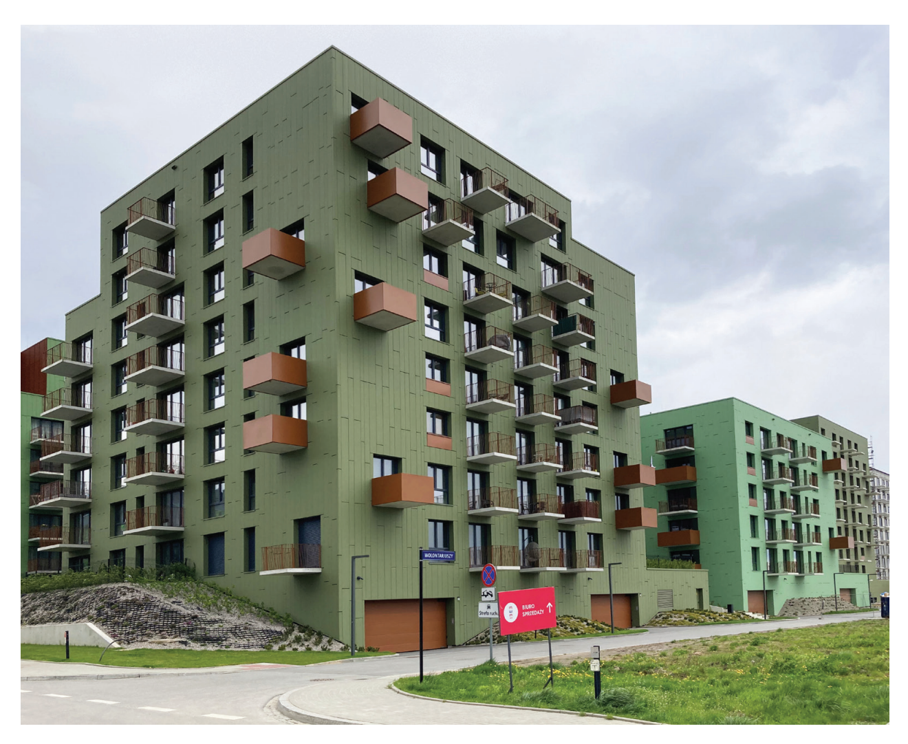
Fig. 8. Wizjonerów Estate in Krakow. Kompozytorów stage with visible ventilated façade II. 8. Osiedle Wizjonerów w Krakowie. Etap Kompozytorów z widoczną fasadą wentylowaną