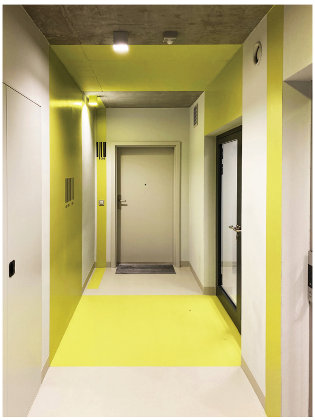
Fig. 4. Wizjonerów Estate in Krakow. Distinctive colour scheme for common spaces in the Wizjonerów stage

In the vicinity of the investment there is Krakow Bronowice railway station which connects the housing estate with the city centre in 10 min by fast agglomeration railway. In the neighbourhood there are also bus stops, in-