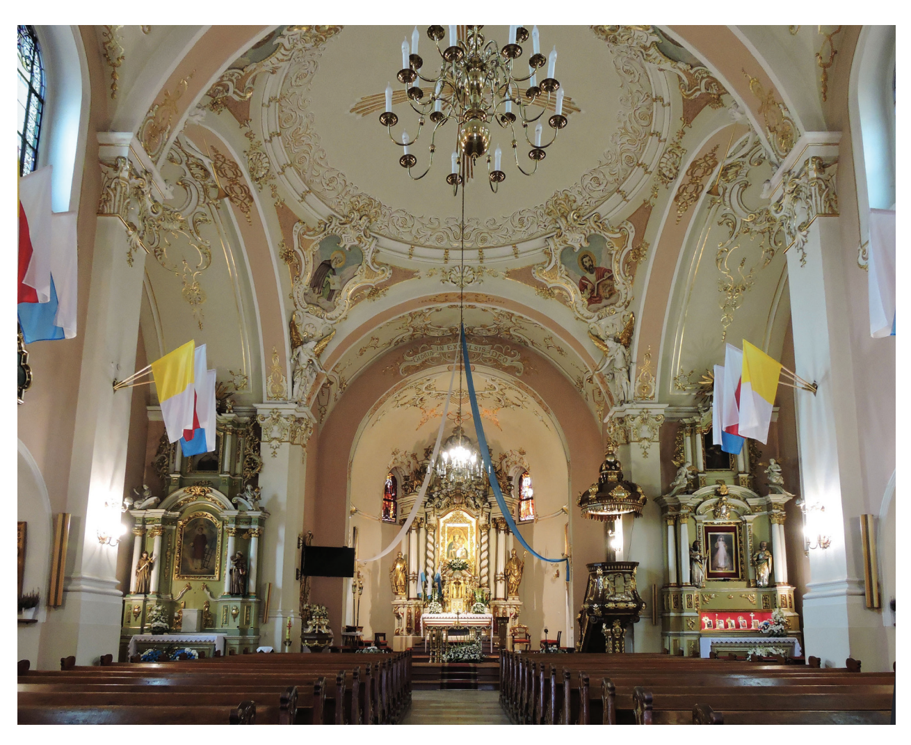
Fig. 8. Sacred Heart of Jesus parish church in Smolice – the interior II. 8. Kościół parafialny Najświętszego Serca Jezusa w Smolicach – wnętrze

through a porch located on the ground level of the tower, with adjacent lateral porches, shaped as central domed chapels built on a square plan, covered with helmet domes on tholobates. Lateral elevations were developed in a modest way. Along the main body of the nave and aisles, they are divided by lesenes separating particular bays. In each bay there is a window: in the lower part, these are horizontal oval windows; in the upper part, the windows are arcaded. Particular storeys are divided by flat cornices. Significantly more opulent forms were given to the high elevations of gable walls of the transept, divided into three storeys. The lower storey is divided by pilasters in the composite order, between which tall, narrow windows were placed, each enclosed by a half-moon. The significantly smaller middle storey, laterally enclosed with volutes, repeats the divisions of the lower storey. In the centre, a rectangular window was built and to the sides, niches with figures of saints were created. The highest storey, also laterally enclosed with volutes and a centrally placed niche containing a figure of a saint, is crowned with a triangular pediment.