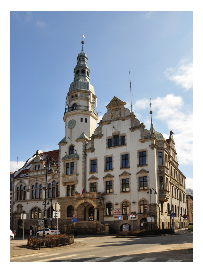
Fig. 11. Town Hall in Kamienna Góra (Landshut), 1904–1905 (arch. "Gaze & Böttcher",)

II. 11. Ratusz w Kamiennej Górze (Landshut), 1904–1905 (arch. "Gaze & Böttcher",)