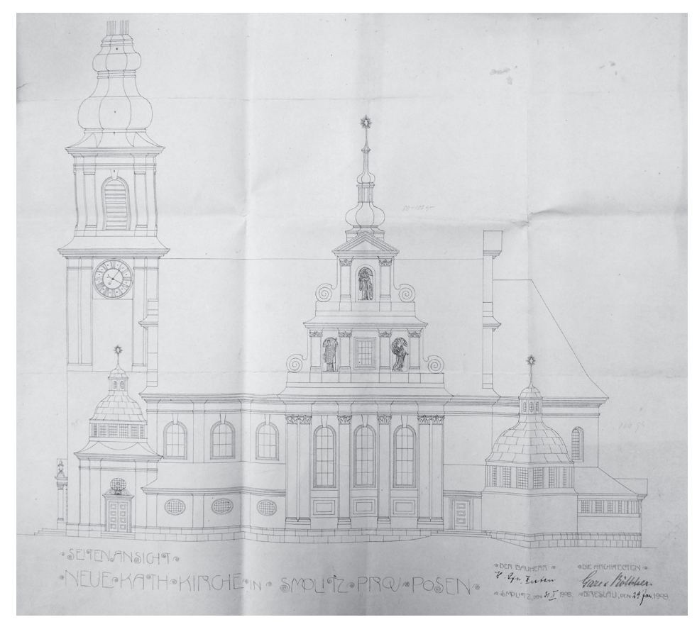
Fig. 6. Palace in Smolice – plan of side elevation of parish church in Smolice, 1908 ("Gaze & Böttcher")

Il. 5. Pałac w Smolicach – projekt elewacji północno-zachodniej pałacu w Smolicach, 1910 (arch. "Gaze & Böttcher")