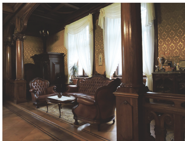
Fig. 4. Palace in Smolice. Interior – the so-called hunting study, southern annex (arch. "Gaze & Böttcher", photo by E. Grochowska/K. Stefański, 2019)

II. 3. Pałac w Smolicach. Elewacja północno-wschodnia głównej bryły pałacu (arch. "Gaze & Böttcher", fot. E. Grochowska/K. Stefański, 2019)