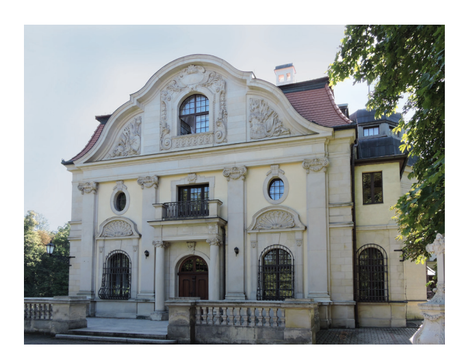
Fig. 3. Palace in Smolice. North-eastern elevation of the main body of the palace (arch. "Gaze & Böttcher", photo by E. Grochowska/K. Stefański, 2019)

II. 3. Pałac w Smolicach. Elewacja północno-wschodnia głównej bryły pałacu (arch. "Gaze & Böttcher", fot. E. Grochowska/K. Stefański, 2019)