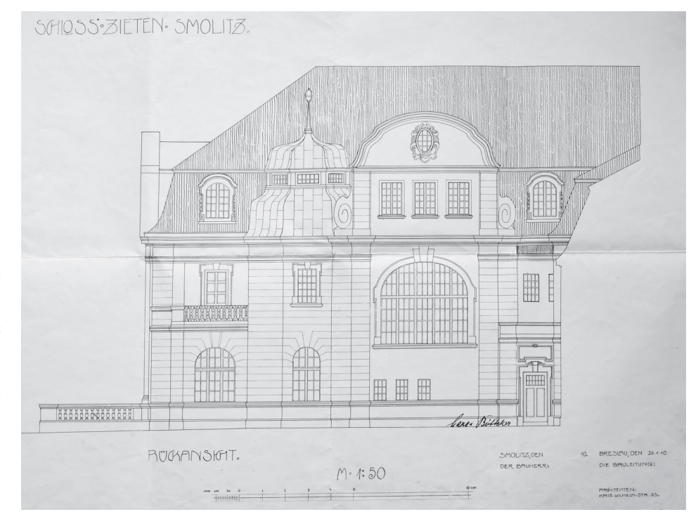
Fig. 5. Palace in Smolice – plan of north-western elevation of the palace in Smolice, 1910 (arch. "Gaze & Böttcher")

Il. 5. Pałac w Smolicach – projekt elewacji północno-zachodniej pałacu w Smolicach, 1910 (arch. "Gaze & Böttcher")