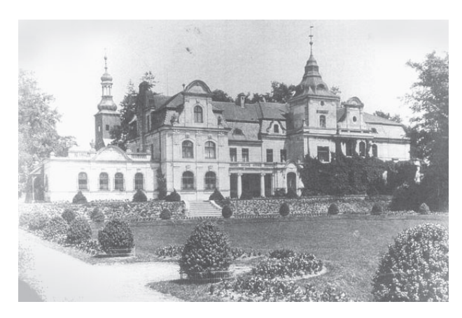
Fig. 1. South-western view of the palace, archival photograph from 1908–1909

II. 1. Widok pałacu od południowego zachodu, fotografia archiwalna z 1908–1909 r.