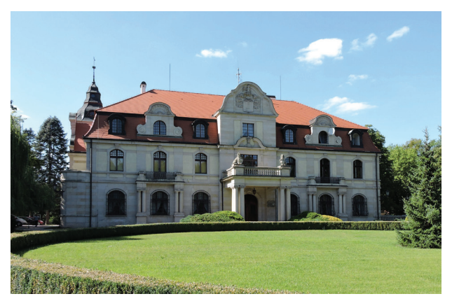
Fig. 2. Palace in Smolice — front elevation (south-east) (arch. "Gaze & Böttcher", photo by E. Grochowska/K. Stefański, 2019) Il. 2. Pałac w Smolicach — elewacja frontowa (płd.-wsch.) (arch. "Gaze & Böttcher", fot. E. Grochowska/K. Stefański, 2019)

II. 1. Widok pałacu od południowego zachodu, fotografia archiwalna z 1908–1909 r. (źródło: fotokopia w posiadaniu firmy: Hodowla Roślin Smolice Sp. z o.o. Grupa IHAR)