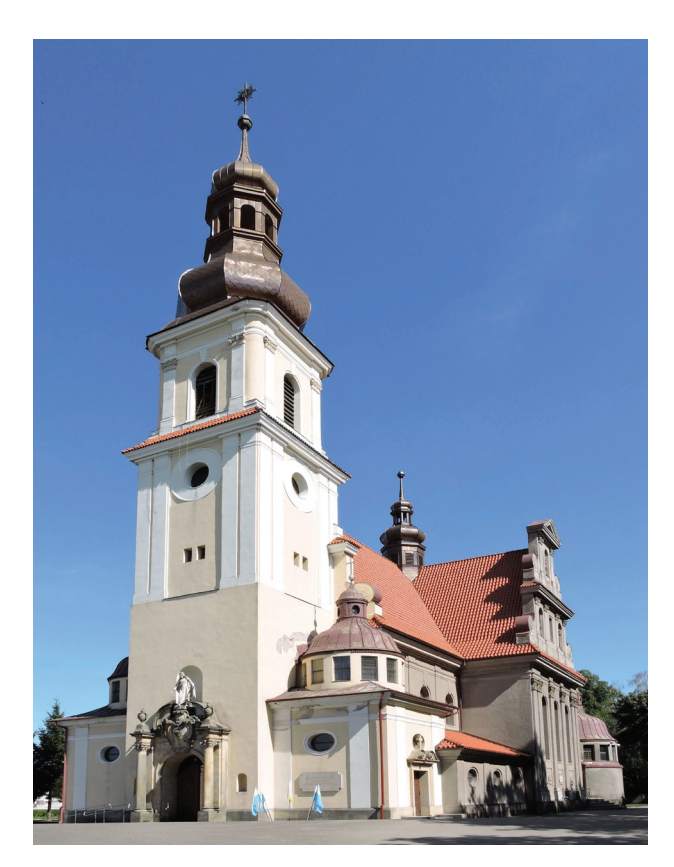
Fig. 7. Parish church in Smolice – general outlook

II. 7. Kościół parafialny w Smolicach – widok ogólny