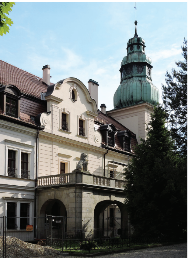
Fig. 12. Palace in Kamieniec (Kaminietz) near Tarnowskie Góry – façade. Restructuring by "Gaze & Böttcher", 1910 (photo by E. Grochowska/K. Stefański, 2021)

II. 11. Ratusz w Kamiennej Górze (Landshut), 1904–1905 (arch. "Gaze & Böttcher", fot. E. Grochowska/K. Stefański, 2021)