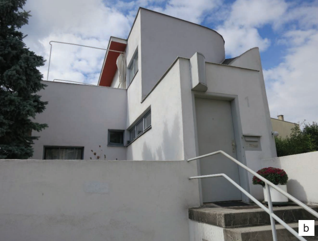
Fig. 6. Weissenhof Werkbund estate in Stuttgart, 1927: