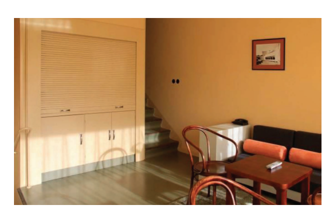
Fig. 15. WuWA Werkbund estate in Wrocław (former Breslau), 1929, hotel like building for single people and childless couples designed by H. Scharoun, renovation design of the split-level apartment of the building's right wing by J. Urbanik and A. Gryglewska, 2008; living room with kitchen niche, 2009–2010

II. 15. Osiedle Werkbundu – WuWA, Wrocław (dawny Breslau), 1929, dom hotelowy dla osób samotnych i małżeństw bezdzietnych zaprojektowany przez H. Scharouna, projekt renowacji mieszkań dwupoziomowych prawego skrzydła budynku: J. Urbanik i A. Gryglewska, 2008; pokój dzienny z niszą kuchenną, 2009–2010