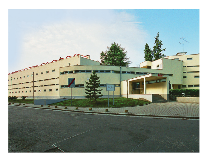
Fig. 11. WuWA Werkbund estate in Wrocław (former Breslau), 1929, hotel like building for single people and childless couples designed by H. Scharoun, original color of the façade, stratigraphic studies of paint coatings by J.M. Żelbromski, 1993, renovation design by J. Urbanik and A. Gryglewska, 1993

Il. 11. Osiedle Werkbundu - WuWA, Wrocław (dawny Breslau), 1929, dom hotelowy dla osób samotnych i małżeństw bezdzietnych zaprojektowany przez H. Scharouna, oryginalny kolor elewacji, badania stratygraficzne powłok malarskich: J.M. Zelbromski, 1993, projekt renowacji: J. Urbanik i A. Gryglewska, 1993