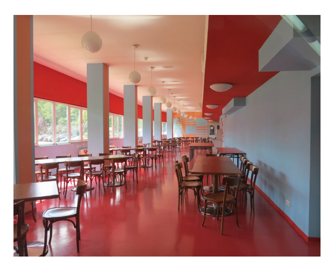
Fig. 13. WuWA Werkbund estate in Wrocław (former Breslau), 1929, hotel like building for single people and childless couples designed by H. Scharoun,

by Adolf Rading in the WuWA estate is also well known. The architect used three contrasting colors: white, black