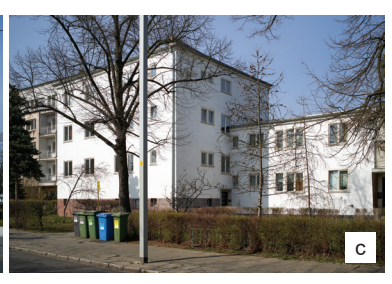
Fig. 7. WuWA Werkbund estate in Wrocław (former Breslau), 1929:

a) eight unit house designed by G. Wolf, after renovation in 2017, renovation design by J. Bułat and K. Bułat, 2016, stratigraphic studies of paint coatings by K. Wantuch-Jarkiewicz and A. Jarkiewicz, 2016,