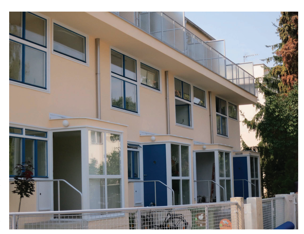
Fig. 10. Lainz Werkbund estate in Vienna, 1932, terraced houses designed by G. Rietveld, after renovation in 2011–2016, renovation design by P. GOOD Praschl-Goodarzi Architekten

In Gerrit Rietveld's house in Vienna, the pastel pink of the façade was contrasted with the sapphire and spring green of the door frames both in and outside the building (Fig. 10). This house is nothing like his 1924 Utrecht project, (the house of interior designer Truus Schröder-