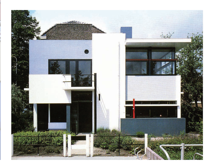
Fig. 4. House designed by G.T. Rietveld for Mrs. T. Schröder-Schräder in Utrecht, 1924, original colour scheme

In addition to the color trend, around 1926 a style of architecture emerged in Germany where white was the dominant color. The creators of "white architecture" were inspired by Suprematism and Neo-Plasticism in art as well as by the achievements of Le Corbusier and the Dutch group De Stijl in architecture. Piet Mondrian attributed a specific meaning to primary colors: blue was supposed to be distancing, yellow – extending, red – rising [34]. They merely complemented white (in some cases also gray and black) in the plastic composition of colors on smooth façades. Mondrian's early paintings (until 1921) used primary colors largely muted by white, while the introduction of pure primary colors in full saturation was caused by Bart van der Leck and his important contributions to De Stijl . A model