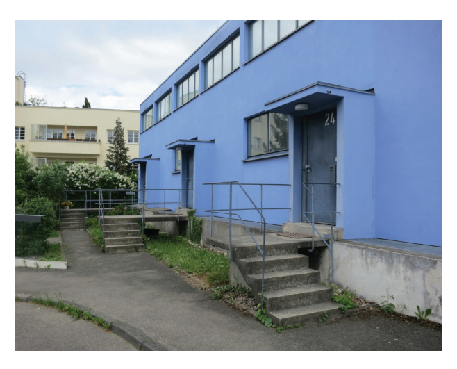
Fig. 8. Weissenhof Werkbund estate in Stuttgart, 1927, terraced houses designed by M. Stam, after the renovation in the 1980's

II. 8. Osiedle Werkbundu – Weissenhof, Stuttgart, 1927, dom szeregowy zaprojektowany przez M. Stama, po renowacji w latach 80. XX w.