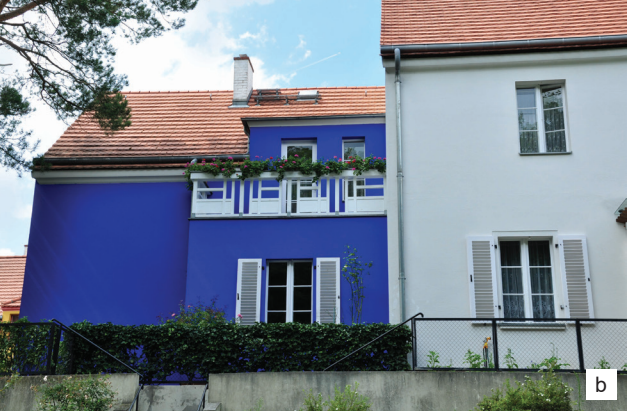
Fig. 1. Falkenberg garden estate in Berlin-Treptow, designed by B. Taut, 1913–1916, current state, color reconstruction design by W. Brenne: a) terraced houses, Gartenstadtweg, b) multi-family houses, Gartenstadtweg

II. 1. Osiedle ogrodowe Falkenberg, Berlin-Treptow, zaprojektowane przez B. Tauta, 1913–1916, stan obecny, projekt rekonstrukcji kolorystyki – W. Brenne: a) zabudowa szeregowa, Gartenstadtweg, b) dom wielorodzinny, Gartenstadtweg