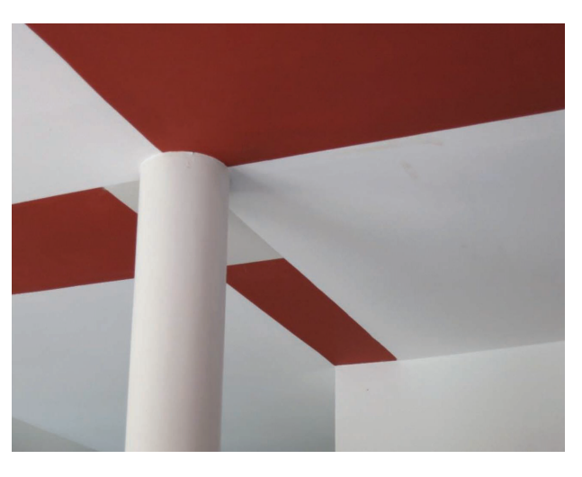
Fig. 9. Weissenhof Werkbund estate in Stuttgart, 1927, detached house designed by H. Scharoun, after renovation in the 1980's, interior

II. 8. Osiedle Werkbundu – Weissenhof, Stuttgart, 1927, dom szeregowy zaprojektowany przez M. Stama, po renowacji w latach 80. XX w.