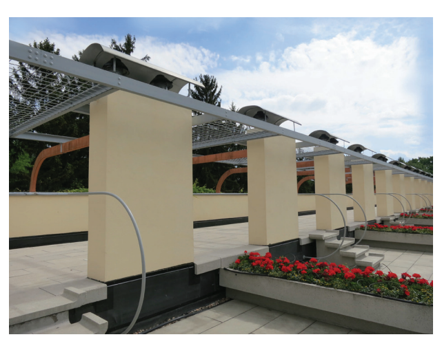
Fig. 12. WuWA Werkbund estate in Wrocław (former Breslau), 1929, hotel like building for single people and childless couples designed by H. Scharoun, renovation design by J. Urbanik, A. Gryglewska and A. Tomaszewicz, 2011, 2013, roof terrace of the building's left wing, after renovations in 2011, 2013

Il. 11. Osiedle Werkbundu - WuWA, Wrocław (dawny Breslau), 1929, dom hotelowy dla osób samotnych i małżeństw bezdzietnych zaprojektowany przez H. Scharouna, oryginalny kolor elewacji, badania stratygraficzne powłok malarskich: J.M. Zelbromski, 1993, projekt renowacji: J. Urbanik i A. Gryglewska, 1993