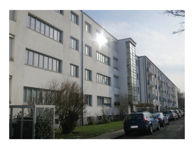
Fig. 5. Dammerstock estate in Karlsruhe, designed by W. Gropius with the team, 1929, multi family block of flats, post-renovation, renovation design by matzka architekt (photo by J. Urbanik, 2013)

Adolf Hitler's rise to power in 1933 marked the end of "white architecture", and meant the closing of progressive schools (Bauhaus, Academy of Art in Wrocław) and the dispersion of the German avant-garde community around the world.