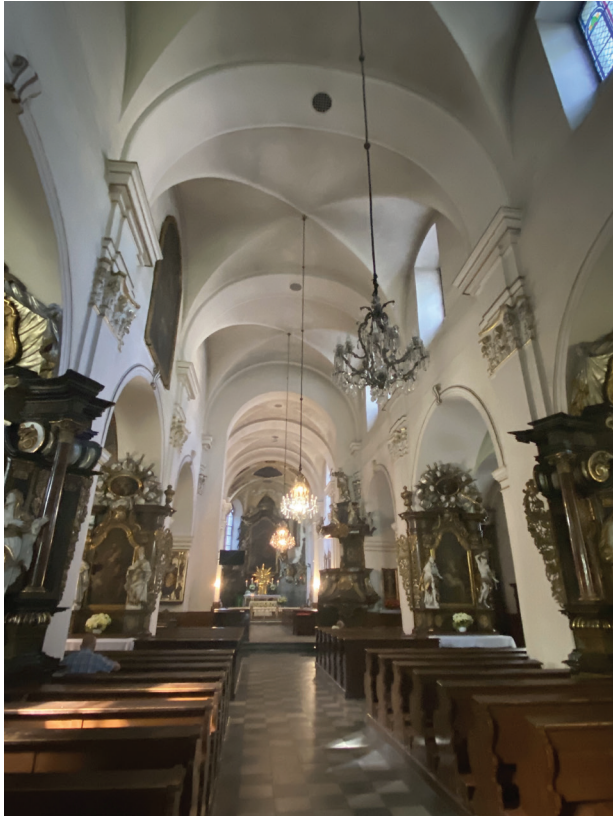
Fig. 3. Opole, the post-Dominican church of Our Lady of Sorrows and St. Wojciech, the central nave – view towards the east (photo by A. Legendziewicz)

Il. 3. Opole, kościół poddominikański pw. Matki Boskiej Bolesnej i św. Wojciecha, nawa główna w widoku ku wschodowi (fot. A. Legendziewicz)