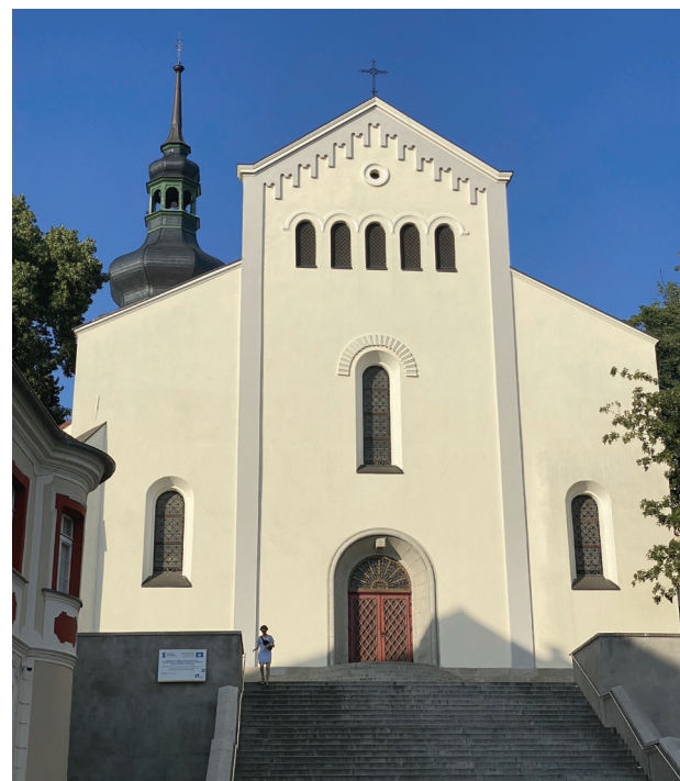
Fig. 1. Opole, post-Dominican church of Our Lady of Sorrows and St. Wojciech, view from the west

The four-span nave has a varied spatial layout – basilica-like on the south side, and pseudo-basilica on the north. Its façades are devoid of buttresses – except for one diagonal buttress in the north-western corner. The side aisles and the main nave from the west are illuminated by windows with semi-circular arches. The windows in the southern