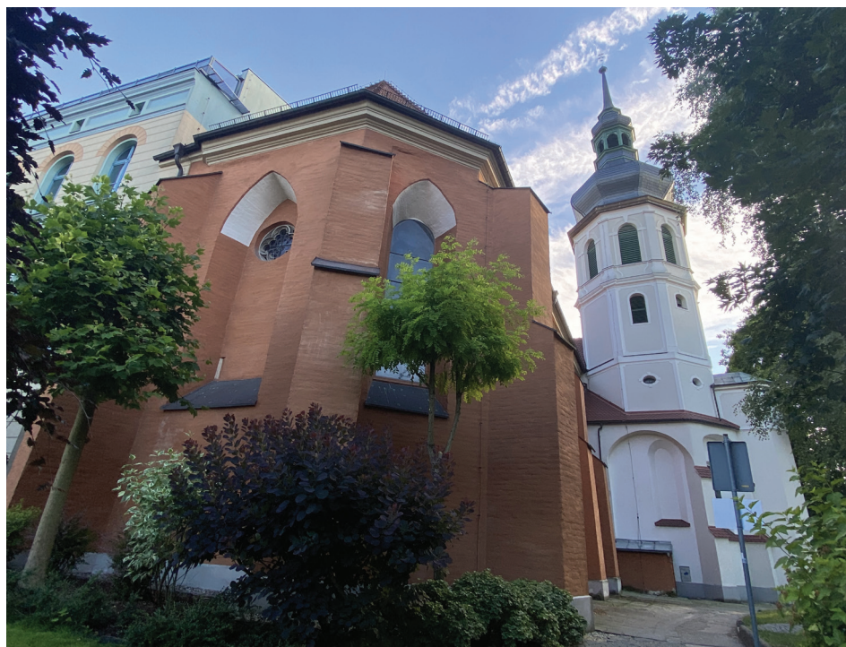
Fig. 2. Opole, the post-Dominican church of Our Lady of Sorrows and St. Wojciech, view from the east

Il. 2. Opole, kościół poddominikański pw. Matki Boskiej Bolesnej i św. Wojciecha, widok od wschodu