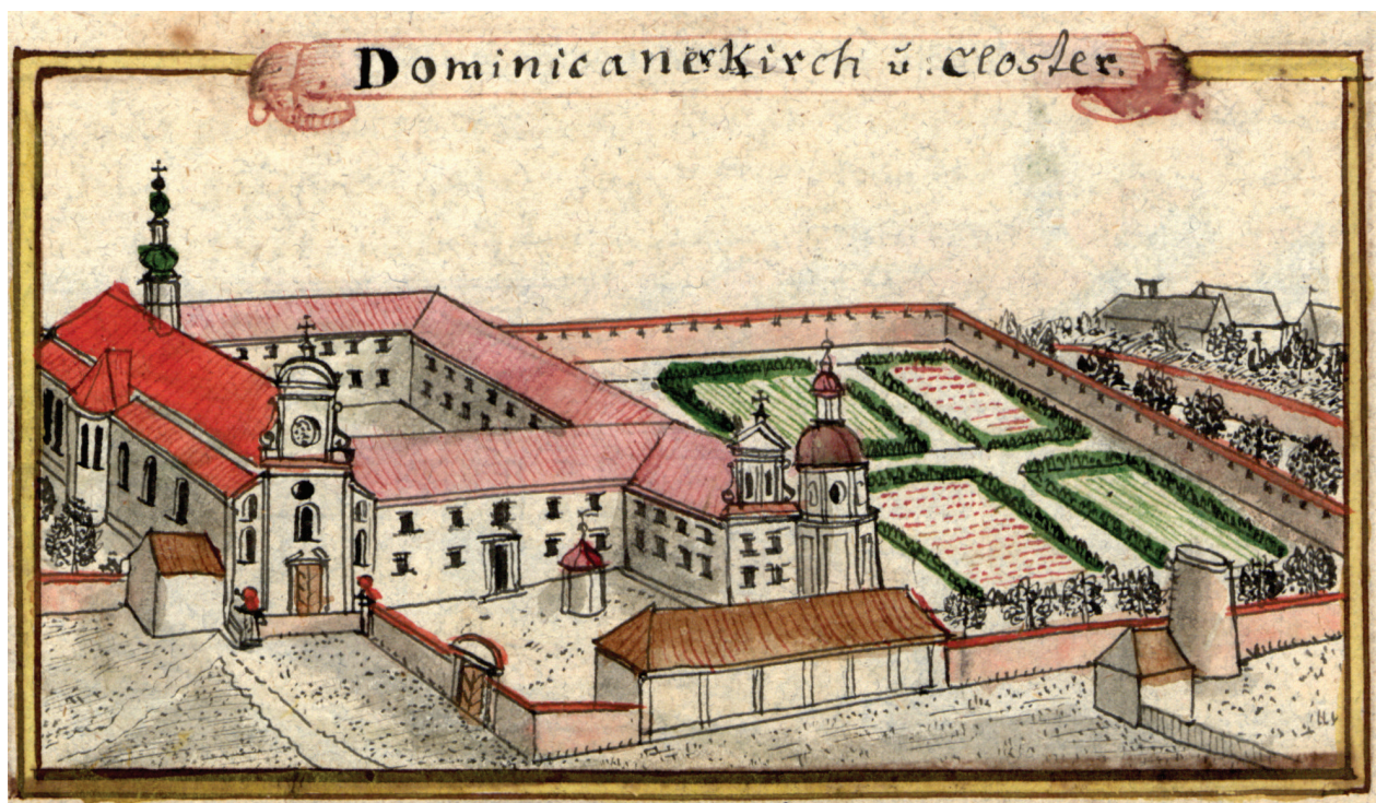
Fig. 5. Opole, post-Dominican church of Our Lady of Sorrows and St. Wojciech, view from the north-west, engraving from around the mid-18 th century. F.B. Werner

Il. 5. Opole, kościół poddominikański pw. Matki Boskiej Bolesnej i św. Wojciecha, widok od północnego zachodu, rycina z około połowy XVIII w. F.B. Wenera