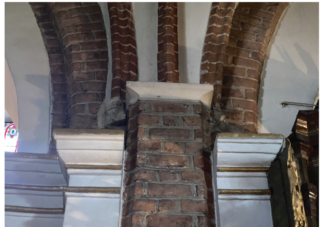
Fig. 8. Opole, post-Dominican church of Our Lady of Sorrows and St. Wojciech, northern aisle, detail of the upper part of the pillar and the tas-de-charge of the inter-nave arcades

The texture and colours of the Gothic façade were made of bricks measuring 7.7–9 × 10.8–12.0 × 24.5–25.7 cm, which were arranged in a regular two-colour stretcher