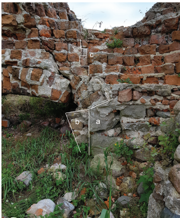
Fig. 9. Koło, ruins of the castle. Northern façade from the outside. View on the east side. Markings: a) the foundation of the residential tower, b) the rebuilding associated with the addition of an arch with the eastern curtain, c) the course of the preserved toothing

Il. 9. Koło, ruiny zamku. Elewacja północna od zewnątrz. Widok po stronie wschodniej. Oznaczenia: a) podmurówka wieży mieszkalnej, b) przemurowanie związane z dostawieniem łuku z kurtyną wschodnią, c) przebieg zachowanych strzępi