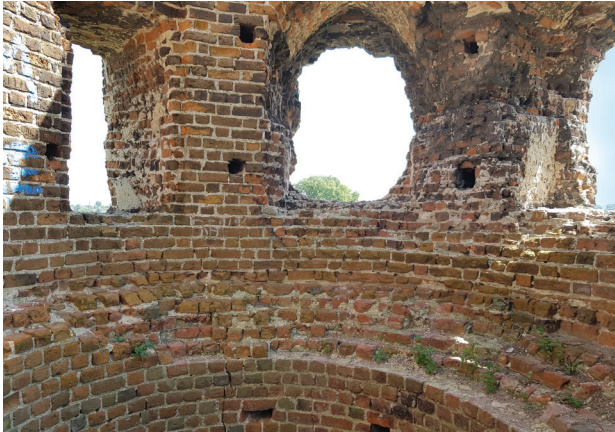
Fig. 2. Koło, ruins of the castle. The interior of the upper level of the tower

Il. 2. Koło, ruiny zamku. Wnętrze górnego poziomu wieży