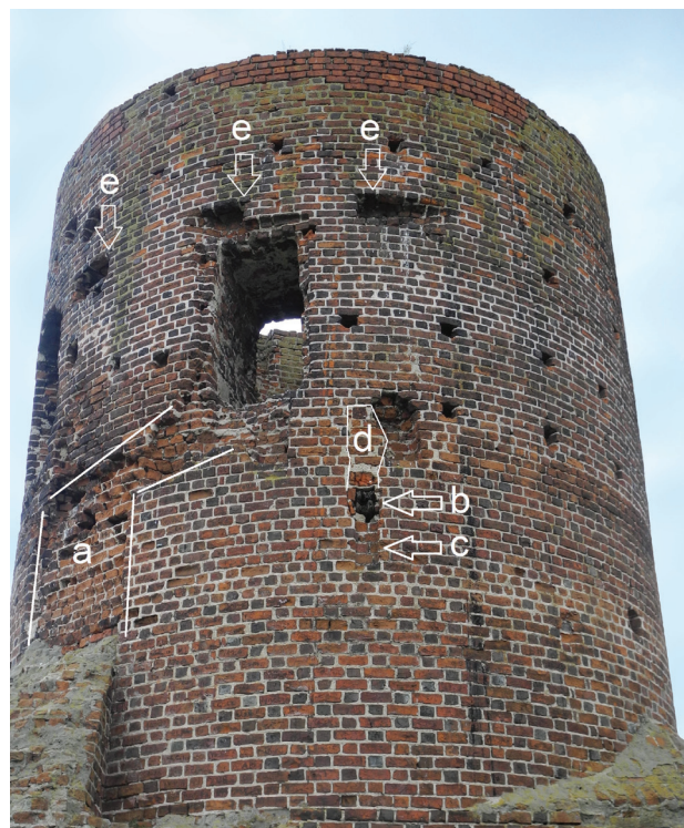
Fig. 10. Koło, ruins of the castle. The upper part of the tower in the south-west corner. Markings: a) forging of the southern curtain, b-d) traces of ceiling beams, e) roofing traces

Il. 9. Koło, ruiny zamku. Elewacja północna od zewnątrz. Widok po stronie wschodniej. Oznaczenia: a) podmurówka wieży mieszkalnej, b) przemurowanie związane z dostawieniem łuku z kurtyną wschodnią, c) przebieg zachowanych strzępi