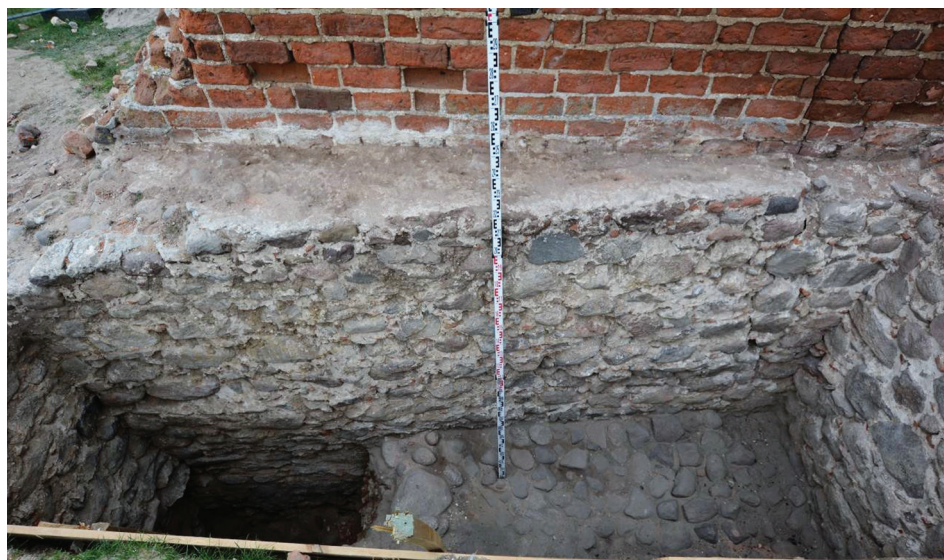
Fig. 8. Koło, ruins of the castle. Cobbled interior of the basement storey of the gate building, view towards the west (photo by A. Róžański, 2020)

Il. 8. Koło, ruiny zamku. Brukowane wnętrze kondygnacji piwnicznej budynku przybramnego, widok w kierunku zachodnim (fot. A. Róžański, 2020)