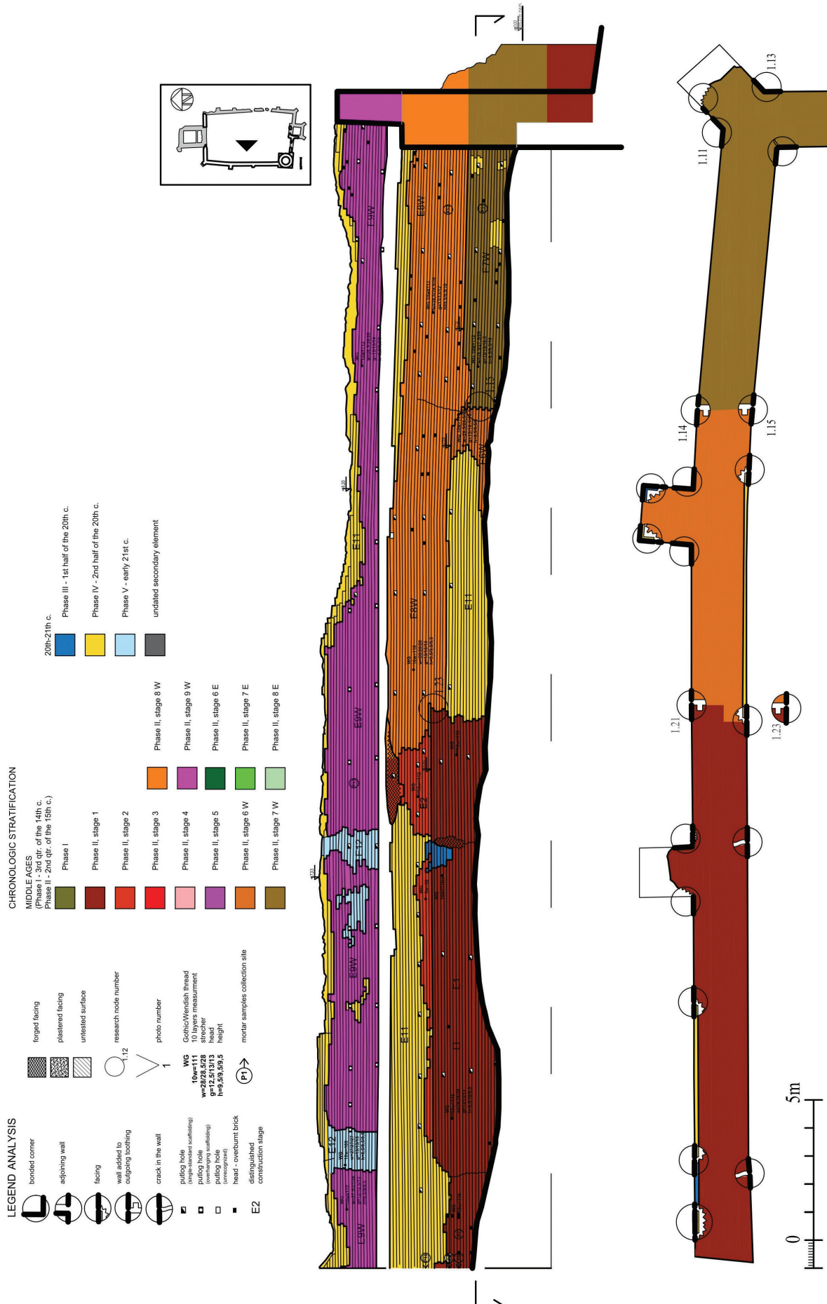
Fig. 6. Kolo, ruins of the castle. Western elevation, view from the courtyard. Results of architectural research (elaborated by M. Prarat, U. Schaaf)

Il. 6. Kolo, ruiny zamku. Elewacja zachodnia, widok od strony dziedzińca. Wyniki badań architektonicznych (oprac. M. Prarat, U. Schaaf)