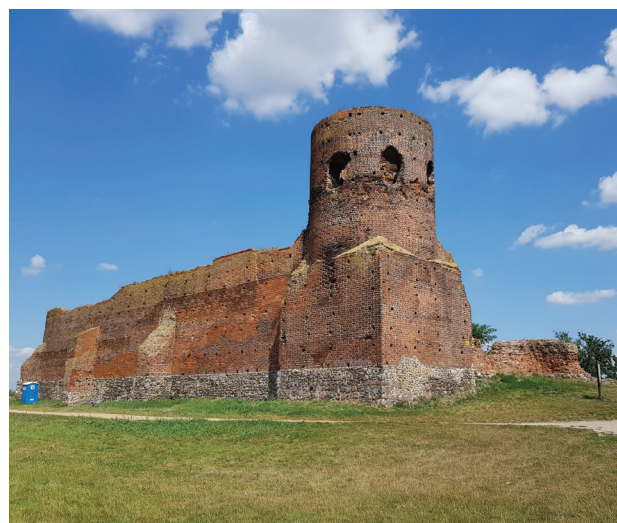
Fig. 1. Koło, ruins of the castle. View from the south-west

The western and southern curtains connect in the corner with a prominent tower built on a plan similar to a rectangle. It is over 5 m high. Using four corner squinches, it turns into a 9.2 m high cylinder. At a height of about 4 m from its base, there are five forged holes. From the northern and eastern sides, they serve as communication passages, while the three central ones from the south-western side