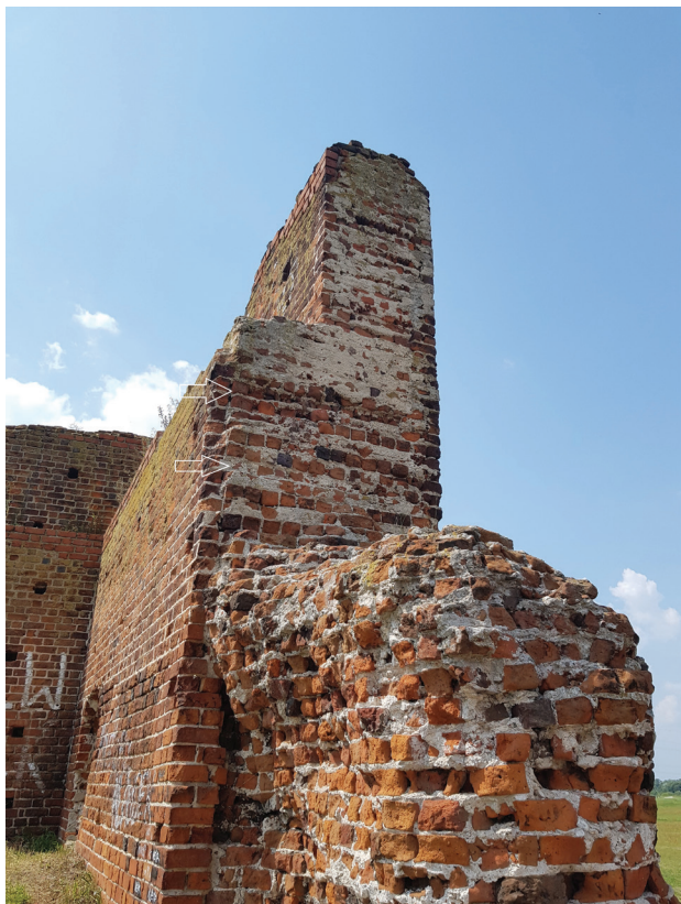
Fig. 4. Koło, ruins of the castle. Northern façade. View of the western wall with the imprint of the residential tower

Il. 4. Koło, ruiny zamku. Elewacja północna. Widok na ścianę zachodnią z odciskiem po wieży mieszkalnej