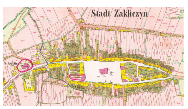
Fig. 2. Zakliczyn on the Galician Cadaster from 1848

The town was found not to possess an up-to-date historical monument preservation program, which is unfortunate, as such a document, the drafting of which every four years is mandatory for a municipality, as stipulated in the historical monument protection and preservation act [23], supports local communities in revalorizing and preserving