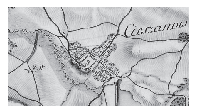
Fig. 4. Cieszanów on the First Military Survey – Map of Galicia and Lodomeria of 1769–1783

The town was founded between two pre-existing villages. To the west of it was Wola Nowosielecka (previous-