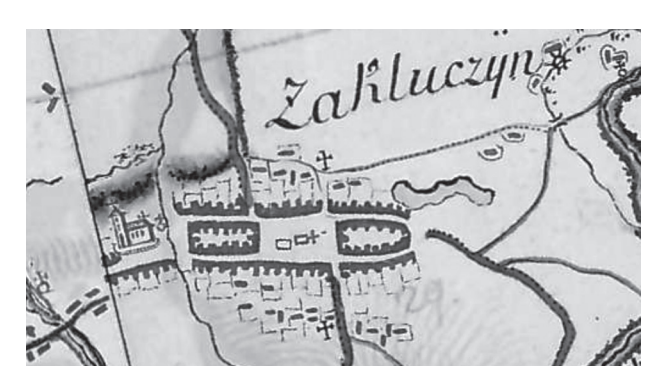
Fig. 1. Zakliczyn on the First Military Survey – the Map of Galicia and Lodomeria in the years 1769–1783 (source: Archives of the Chair of the History of Architecture and Monument Conservation of the FoA CUT – Urban Planning Team, map photo)

II. 1. Zakliczyn na I Zdjęciu Wojskowym, Mapie Galicji i Lodomerii z lat 1769–1783 (źródło: Archiwum Katedry Historii Architektury i Konserwacji Zabytków, WA PK Zespół Historii Urbanistyki, fot. mapy)