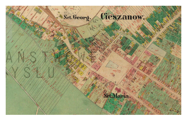
Fig. 5. Cieszanów on the Galician Cadaster from 1854

II. 4. Cieszanów na I Zdjęciu Wojskowym, Mapie Galicji i Lodomerii z lat 1769–1783